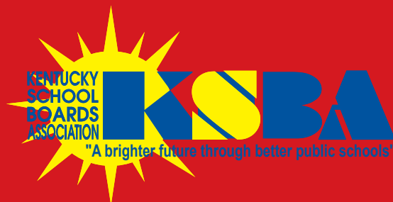
Russellville Independent Performance-Based Education, spring PEAK Award winner.

"A brighter future through better public schools"