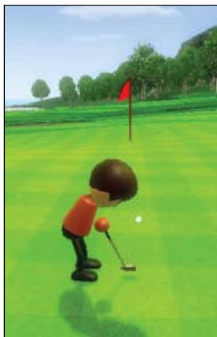
Hole in one for attendance, Page 18

Editor's Note: Next month's issue of the Kentucky School Advocate will be arriving a week earlier than usual to provide timely coverage of KSBA's annual conference.