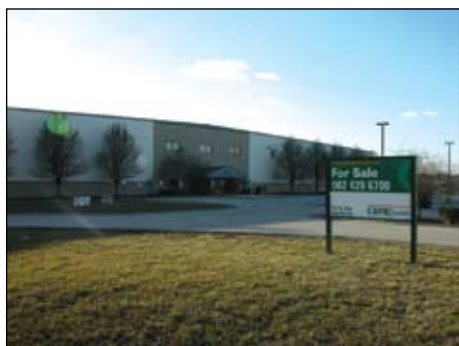
Empty buildings, empty wallets, Page 8

A new generation of video games has been gaining more mainstream acceptance in recent years as a way to increase physical activity levels, but a Breathitt County middle school principal has taken it one step further, as a way to get students to school ... Page 18